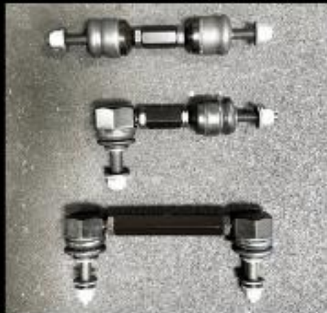
Various models of these links