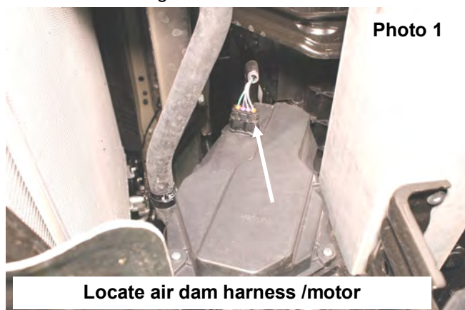
Locate air dam harness /motor