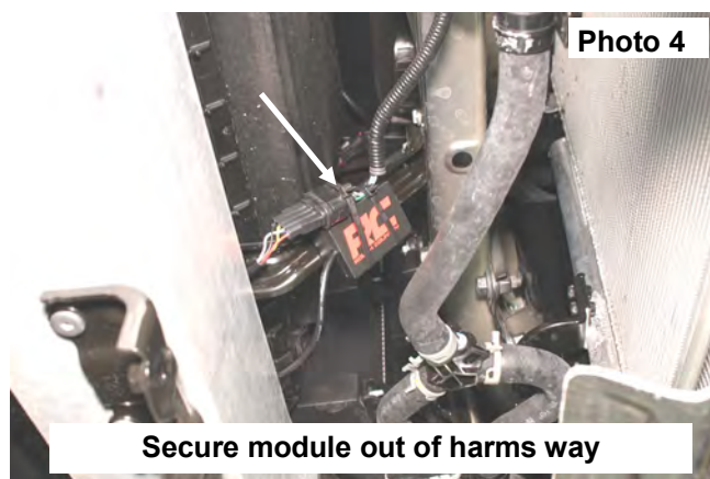
Secure module out of harms way

By purchasing any item sold by Rough Country, LLC, the buyer expressly warrants that he/she is in compliance with all applicable, State, and Local laws and regulations regarding the purchase, ownership, and use of the item. It shall be the buyers responsibility to comply with all Federal, State and Local laws governing the sales of any items listed, illustrated or sold. The buyer expressly agrees to indemnify and hold harmless Rough Country, LLC for all claims resulting directly or indirectly from the purchase, ownership, or use of the items.