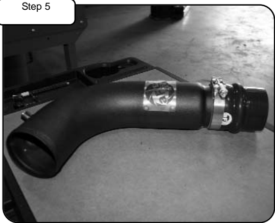
Install 3" hump coupler with clamps provided to new tube.