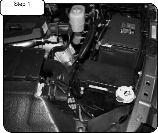
Complete Stock Intercooler tube.