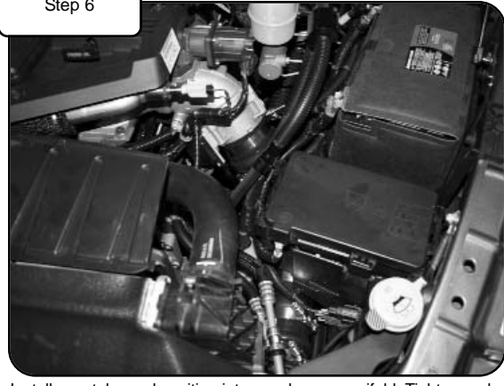
Install new tube and position into coupler on manifold. Tighten and torque all four clamps to 75 in-lbs. Check and tighten after 50 miles! Your Intercooler tube installation is now complete. Thank you for choosing aFe power!

Place the included CARB EO sticker on or near the Intercooler Tube on a smooth, clean surface. EO identification label is required to pass the Smog Check Inspection.