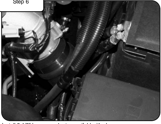
Install 3-1/2" hump coupler to manifold with clamps provided.