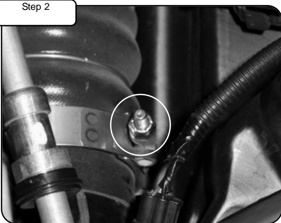
With 7/16" deep socket, loosen clamp on intercooler.