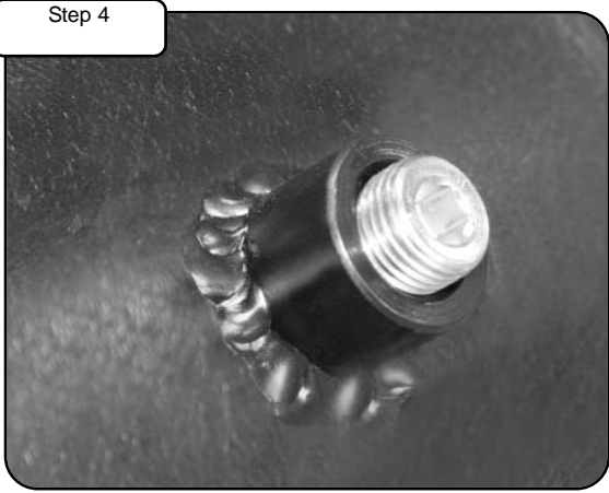
Install plugs in to 1/8" NPT ports with 3/16" hex key.