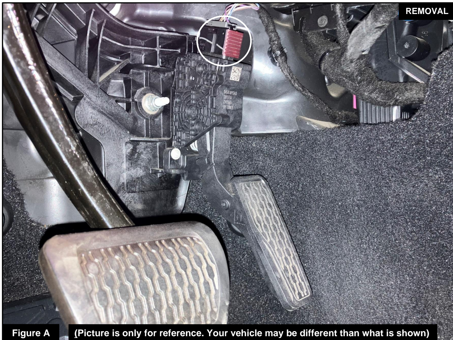
Figure A (Picture is only for reference. Your vehicle may be different than what is shown)