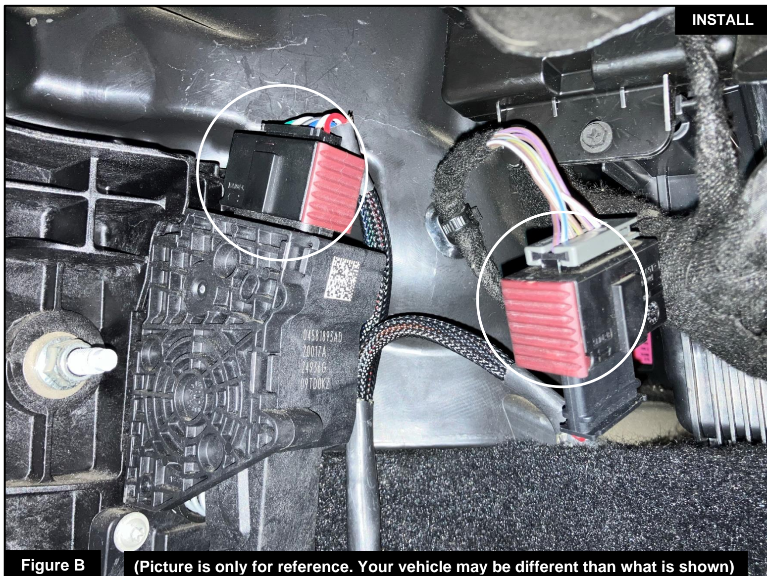
Figure B (Picture is only for reference. Your vehicle may be different than what is shown)