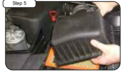
Using a standard screwdriver loosen the clamp securing intake track to factory airbox. Undo clamps securing top half of airbox and remove top half. Set aside for future removal of stock MAF sensor.