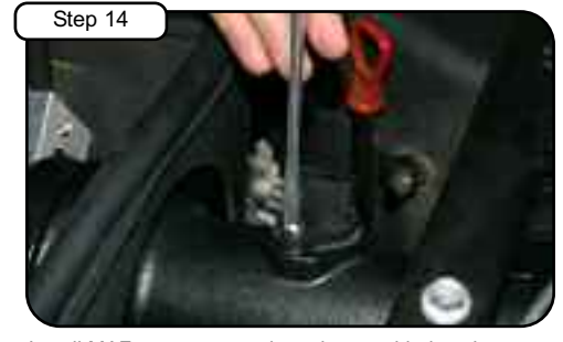
Install MAF sensor onto tube using provided gaskets, spacers and screws.