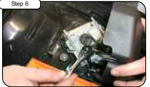
Remove plastic cover from headlight controller via locking tabs. Using a 10mm socket, remove the (2) bolts securing controller to allow for its movement and to release lower half of airbox.