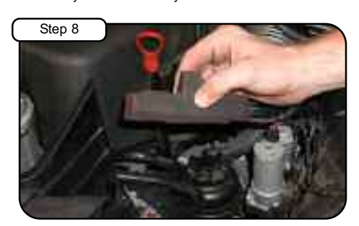
Remove rubber mount from tab beneath factory airbox.