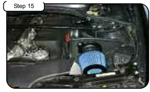
Place enclosed CARB EO sticker on a clean/smooth surface on or near device. EO identification label is required in passing the Smog Check Inspection. Make sure all hoses and clamps are tight and that all electrical components (if applicable) are secure. Check and retighten connections and filter after a few hours of operation.

Note: Filter Cleaning and Re-oiling: When cleaning your aFe filter, be sure to use only aFe's "Restore Kit" (aFe P/N: 90-50001 blue oil aerosol, or aFe P/N: 90-50501 blue squeeze bottle oil). Filter Replacement: PN: 24-91038 (black w/blue media). Pro Dry S <sup>TM</sup> P/N: 21-50505 Pro Dry S <sup>TM</sup> cleaning: see cleaning instruction sheet 06-00074