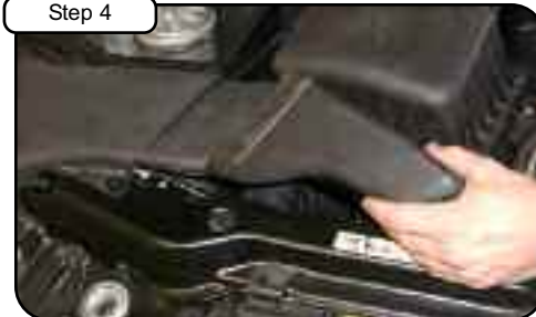
Remove front snorkel from ducting to stock airbox.

Remove factory harness from MAF sensor and place out of the way until re-assembly.