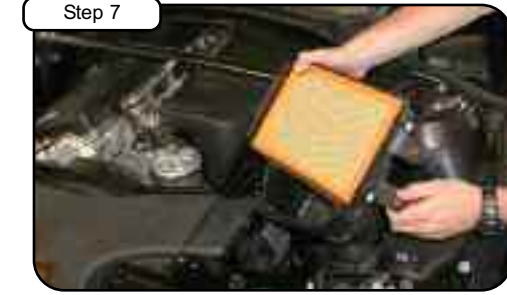
Using a 10mm socket remove the remaining bolt holding the factory intake in place, remove the lower half of the intake. Set the bolt aside for re-installation of heat shield.