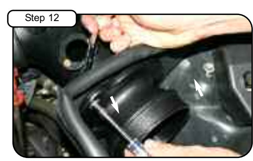
Align two holes on tube flange to holes on housing. Use provided M6 hardware to mount tube flange to housing.