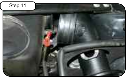
Slide coupler onto tube and place tube through housing hole.