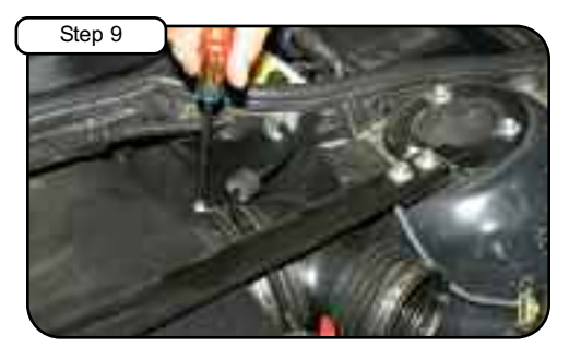
Remove factory accordion coupler using \frac{1}{4} " nut driver or flat screwdriver.