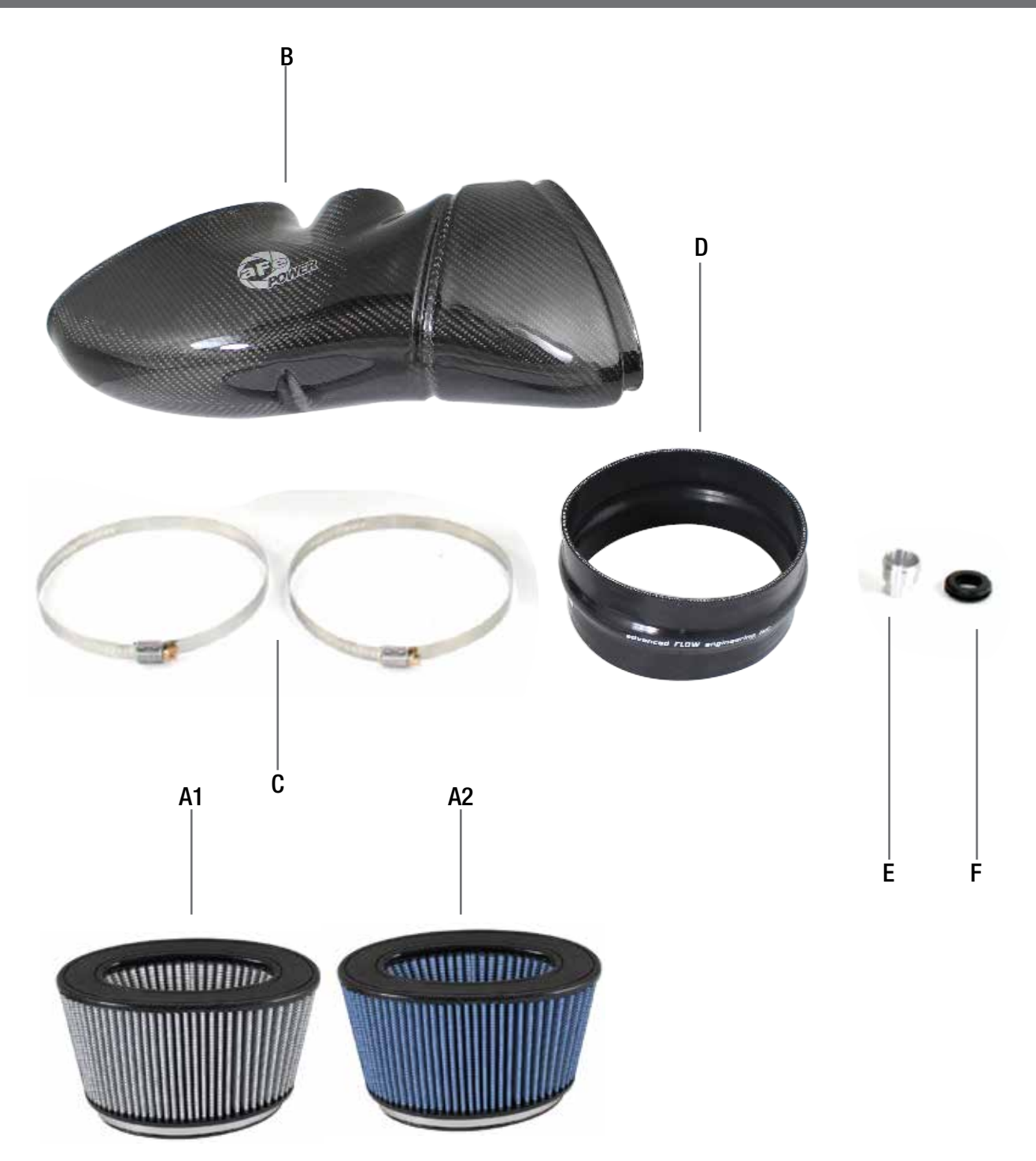
Page 3 aFepower.com