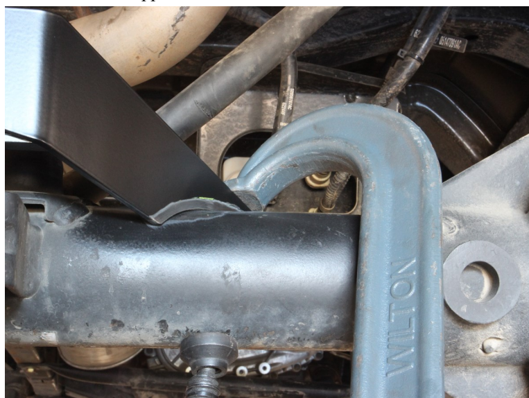
23. Primer and paint the welded section to prevent it from rusting.