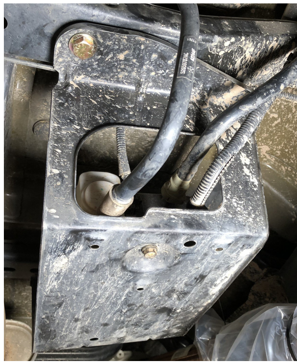
Up Front, drill the 2nd 1/2" hole all the way through the crossmember and use the 2nd 1/2" bolt to secure the 2nd mounting location.