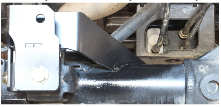
24. Move onto the Track Bar Instructions.