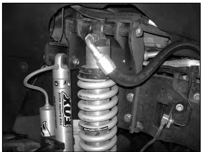
FIG 4A FIG 4B