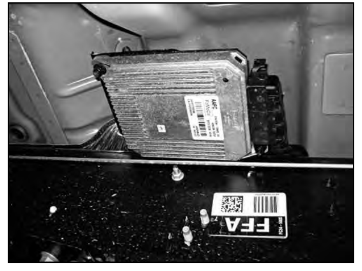
FIG 1A FIG 1B