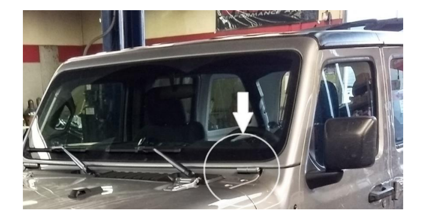
Step 2: With the hardware included in the kit, place one M6 washer onto each M6 bolt, insert the four bolts and washers into driver and passenger side brackets and then place one spacer onto each bolt.