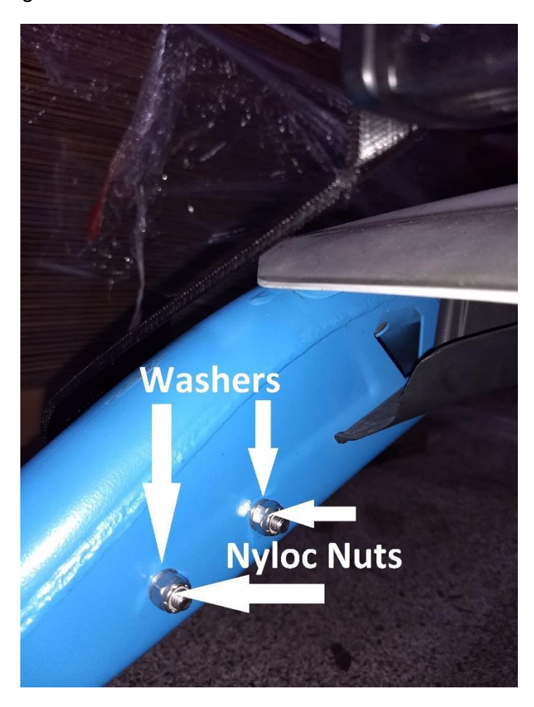
Step 3: Fully tighten all bolts and adjust light.