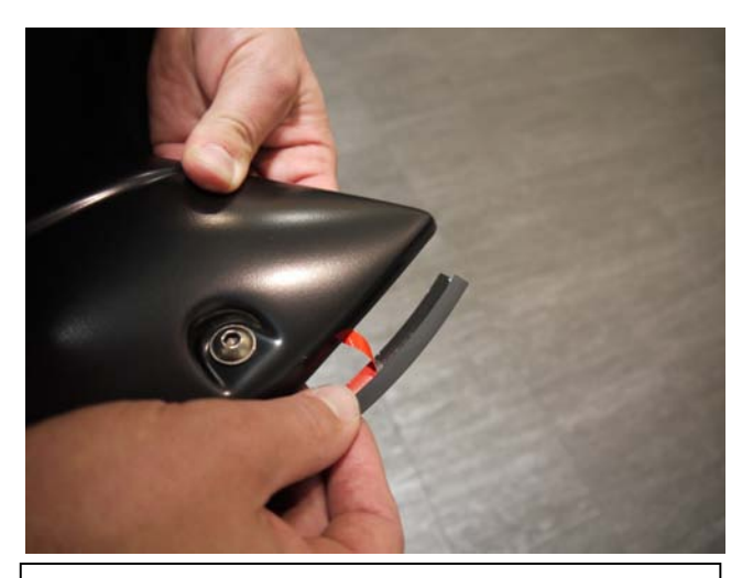
STEP 9: Attach the included rubber seal to the Fender Flares. Peel back 2" of the adhesive backing and position on the Fender Flare. Attach the seal to the Fender Flare, peeling back a few inches at a time. Attach rubber seal along all areas the Fender Flare will make contact with the vehicle body.