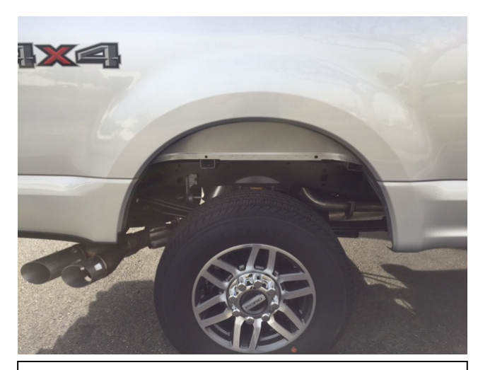
STEP 10: Clean the body areas where the Fender Flares will makes contact. Use the supplied alcohol wipe. A light misting on fender using a soap and water solution can aid in proper rubber placement

Bolt-On/Rugged Fender Flares Ford Super Duty F250/F350 (17-ON) FIT-FF834