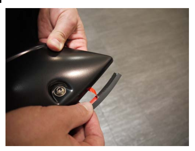
STEP 2: Attach the included rubber seal to the Fender Flares. Peel back 2" of the adhesive backing and position on the Fender Flare. Attach the seal to the Fender Flare, peeling back a few inches at a time. Attach rubber seal along all areas the Fender Flare will make contact with the vehicle body.