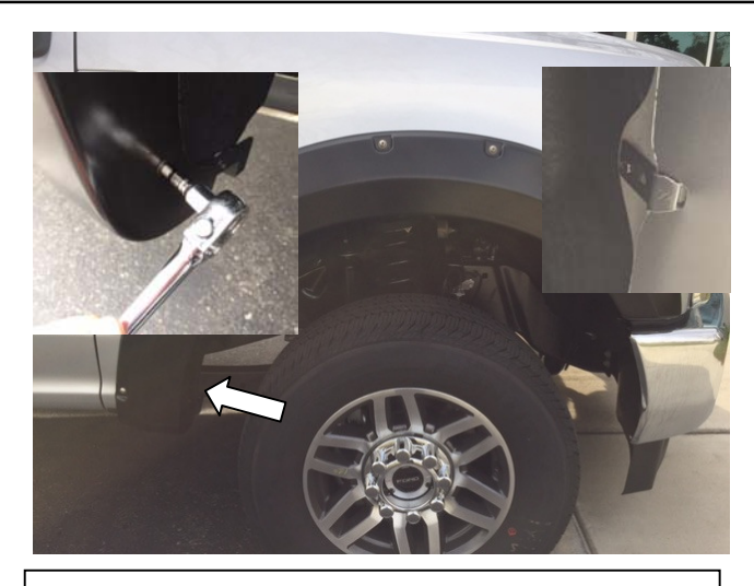
STEP 7: Loosely reinstall the lowest rear 7/32 in socket head screws through slot in the Fender Flare to the vehicle. Make sure the screws are securely engaged to the vehicle fender. Install provided Long Attachment Clips in remaining four (4) Fender Flare Slots. Loosely reinstall remaining 7/32 in socket head screws. Ensure part is still in the position of best fit and extrusion is in correct position before hand tightening all screws.

Bolt-On/Rugged Fender Flares Ford Super Duty F250/F350 (17-ON) FIT-FF834