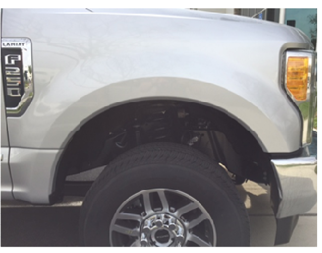
STEP 4: Clean the body areas where the Fender Flares will makes contact. A light misting on fender using a soap and water solution can aid in proper rubber placement