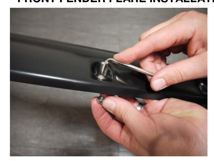
STEP 1: Attach the bolts to each Fender Flare using a 3/16" Allen key and a 10.0mm wrench/socket. (wrench/socket and Allen key not supplied). Ensure inside of Fender Flares where the rubber seal is attached is clean, using the alcohol wipes provided. Wipe away any residue with a dry clean cloth.