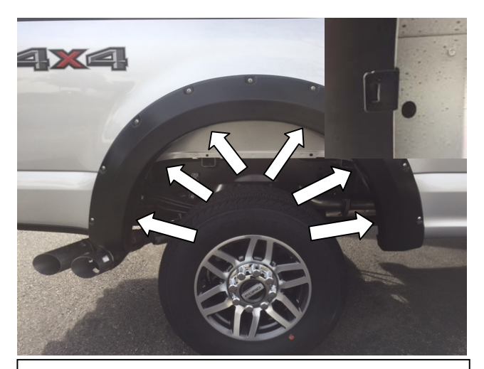
STEP 11: Place the Fender Flare onto the vehicle and fit into the correct position following the contours of the body. Use the twelve (12) provided "U" Shaped Retention Clips (six 6 per side) to secure the Fender Flare to the body. Make sure the dimple in the clip securely attaches in the slot on the Fender Flare.