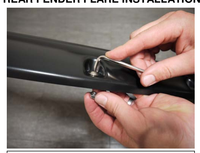
STEP 8: Attach bolts to each Fender Flare using a 3/16" Allen key and a 10.0mm wrench/socket. (wrench/socket and Allen key not supplied). Ensure inside of Fender Flares where the rubber seal is attached is clean, using the alcohol wipes provided. Wipe away any residue with a dry clean cloth.