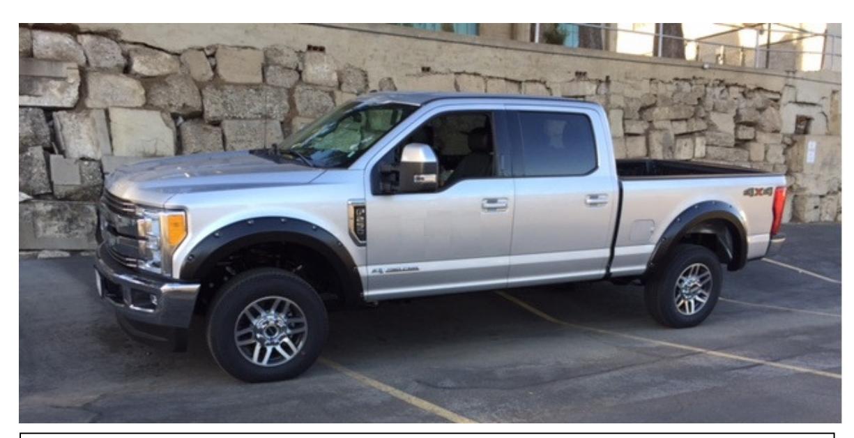
STEP 12: Double check the front and rear Fender Flares to make sure all bolts are tight and clips are securely fastened. Your installation is now complete. Do not use abrasive cleaners.