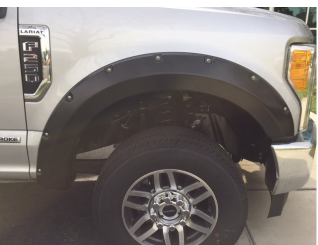
STEP 6: Place the Fender Flare onto the vehicle and fit into the correct position following the contours of the body. Ensure the slots in the part align with the holes in the fender from the previously removed 7/32 in socket head screws.