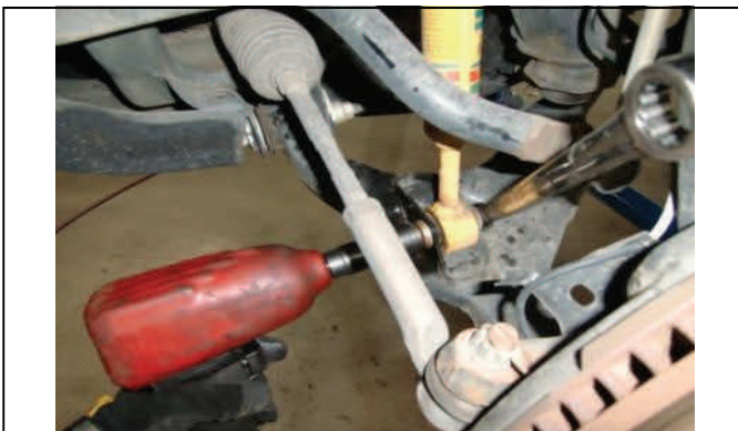
Remove lower strut mounting hardware