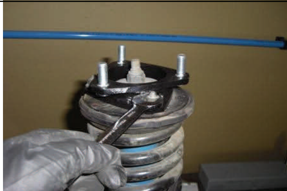
Attach assembled spacer to top of strut w/ OE hardware