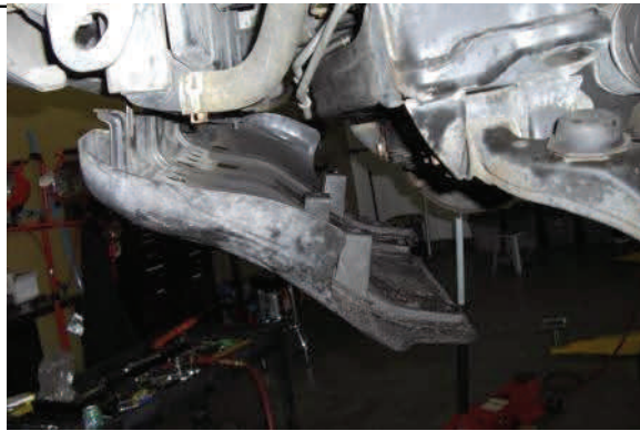
4WD models remove front skid plate