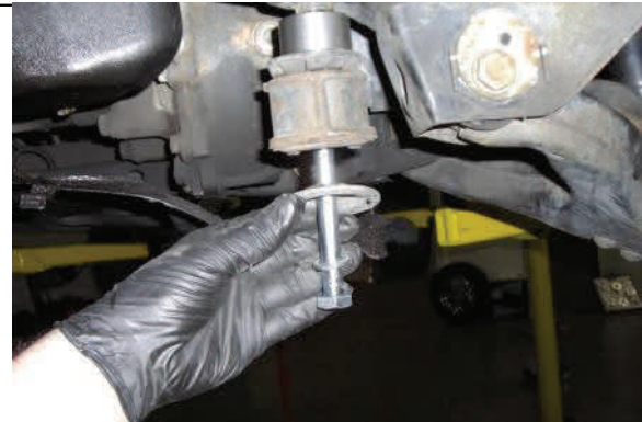
4WD Install longer bolts and reattach differential to frame