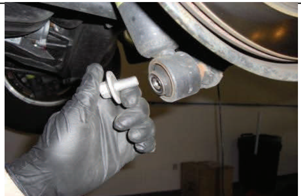
Reconnect and tighten lower shock and sway bar endlinks