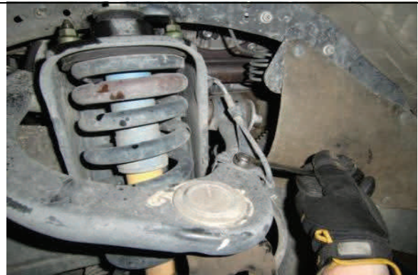
.Disconnect ABS/brake line upper bracket