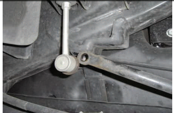
Disconnect lower sway bar endlinks