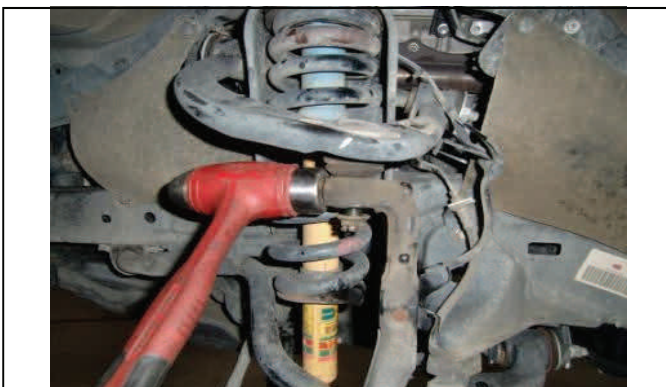
Loosen upper ball joint nut and strike to disconnect