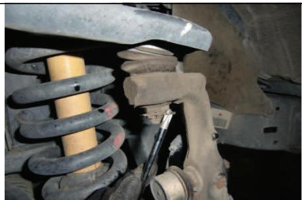
Remove Upper ball joint retaining clip