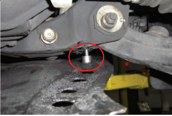
4WD Reattach skid plate with provided spacers and hardware

Reinstall lower strut mounting hardware and torque. Raise suspension and reconnect upper ball joint and tighten, replacing the retaining clip, the reattach both ABS/brake line brackets. Sway bar end links can be done simultaneously once both sides are complete. Recheck all work and check for tire clearance between the upper control arm.