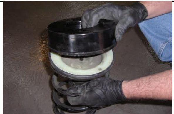
Place coil spacer on top of bump stop on coil spring