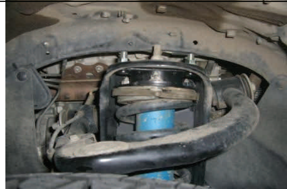
Rotate strut 180 degrees & reinstall with provided hardware