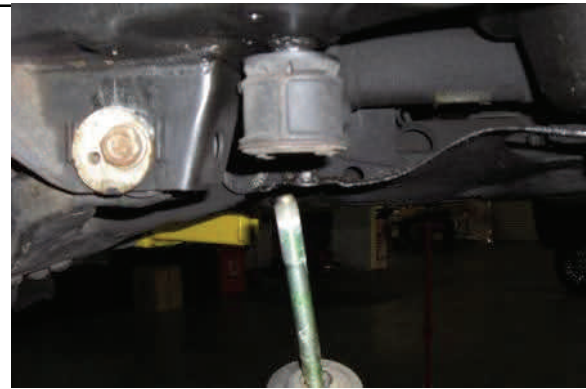
4WD Support differential & remove front mounting hardware