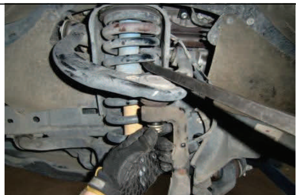
Support suspension and remove upper ball joint nut